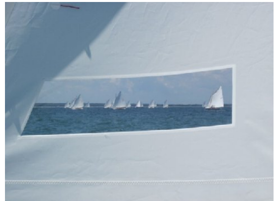
I guess the right was favored.